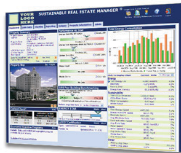
MONITOR & OPTIMIZE PORTFOLIO PERFORMANCE

SRS IS REINVENTING ENERGY EFFICIENCY BENCHMARKING >> DISCOVER HOW >> WWW.SRMNETWORK.COM